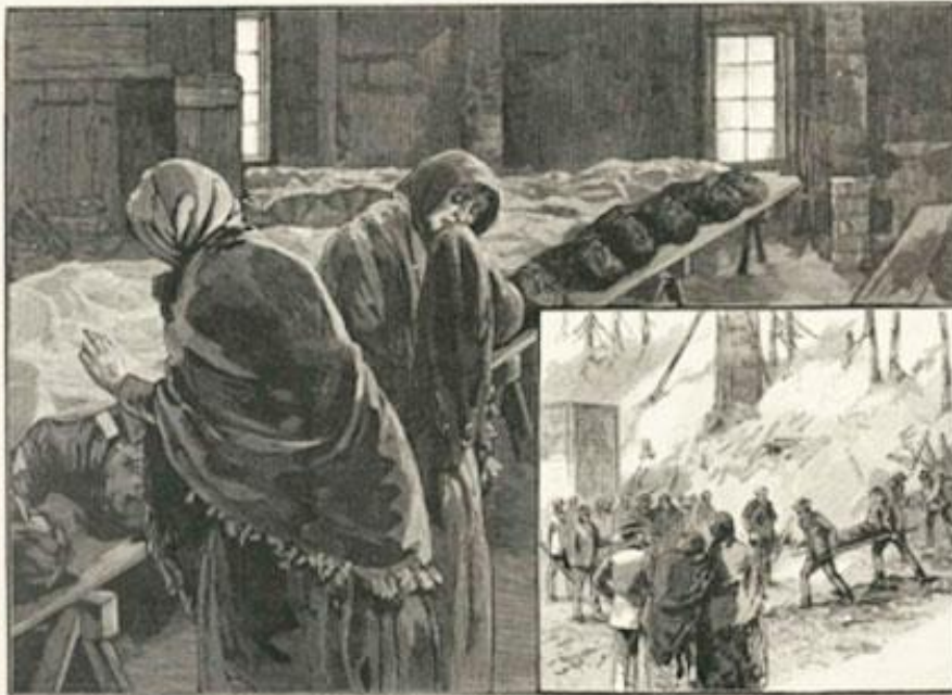
WOMEN AND MINEWORK.