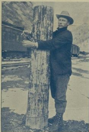
UNDER THE FOLDS OF THE AMERICAN FLAG IN COLORADO!

MARTIAL LAW DECLARED IN COLORADO! HABEAS CORPUS SUSPENDED IN COLORADO! FREE PRESS THROTTLED IN COLORADO! BULL-PENS FOR UNION MEN IN COLORADO! FREE SPEECH DENIED IN COLORADO! SOLDIERS DEFY THE COURTS IN COLORADO! WHOLESALE ARRESTS WITHOUT WARRANT IN COLORADO! UNION MEN EXILED FROM HOMES AND FAMILIES IN COLORADO! CONSTITUTIONAL RIGHT TO BEAR ARMS QUESTIONED IN COLORADO! CORPORATIONS CORRUPT AND CONTROL ADMINISTRATION IN COLORADO! RIGHT OF FAIR, IMPARTIAL AND SPEEDY TRIAL ABOLISHED IN COLORADO! CITIZENS' ALLIANCE RESORTS TO MOB LAW AND VIOLENCE IN COLORADO! MILITIA HIRED TO CORPORATIONS TO BREAK THE STRIKE IN COLORADO!