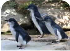
Little blue penguins

The smallest penguin is the little blue penguin. It is only about 13 inches tall and weighs little more than 3 pounds. It lives in southern Australia and New Zealand. Its back feathers range from slate-blue to black.