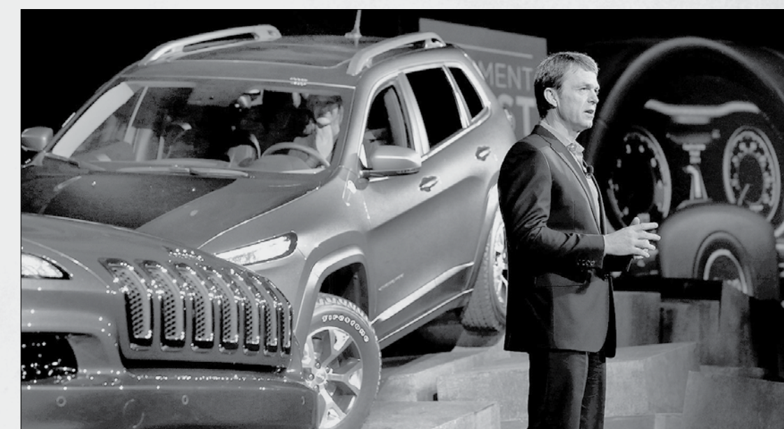
Jeep CEO Mike Manley presents 2014 models of the Jeep Cherokee at the New York International Auto Show in March 2013.

U.S. vehicle sales rise at the fastest pace since 2006 on lower rates and easier financing.