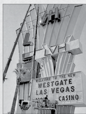
The "LVH" sign at the famed hotel is being removed by new owner Westgate Resorts.

THE STORIED FORMER LAS VEGAS HILTON , famous for staging Liberace and more than 800 sold-out Elvis Presley concerts in the 1960s and 1970s, has a new name and owner. Orlando-based timeshare company Westgate Resorts announced it purchased the LVH hotel from Goldman Sachs and Gramercy Capital and would rename it Westgate Las Vegas Resort & Casino. About 200 of the nearly 3,000 rooms and suites will be converted to timeshare villas, while others will remain open to regular hotel guests.