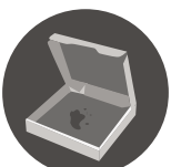
Soiled Paper Items