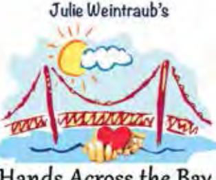
Hands Across the Bay "A Highing Hard for a Better Tomorrow"

presentation, go to handsacrossthebay.org or call 727-573-7720. You also can like Hands Across the Bay on Facebook or follow them on Twitter and Instagram @HandsAcrossTB.