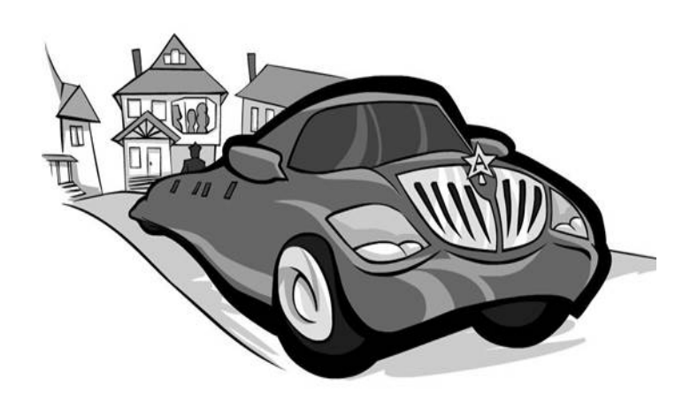
Chapter 13 Way to go, CEO!

"Mom, Dad, yesterday was the best day of my life!"