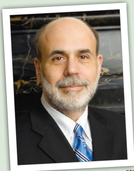
Federal Reserve OPA

Interest rate changes affect everyone. Many banks base the interest rates they pay customers for savings accounts on the prime rate. In addition, many car loans, credit cards and other consumer loans are adjustable rates that are "tied" to the prime.