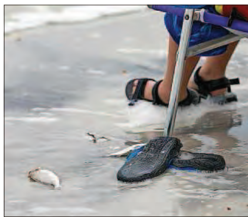
A dead fish rolls in the water near the feet of Jason Crescentini Jr., 7, on the beach at Honeymoon Island State Park.