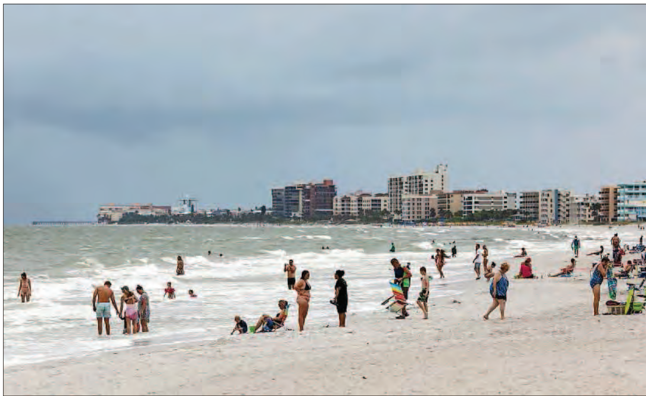
Beachgoers waded in the water along Madeira Beach on Wednesday. A Red Tide bloom in 2017-19 cost Pinellas County more than $7 million to remove dead marine life from its beaches. Officials worry about a repeat incident.

It is still too soon for experts to project whether the Red Tide bloom will dissipate or worsen in the coming days. Nor can experts definitively say that the Red Tide bloom is being fueled by the April release of 215 million gallons of polluted wastewater into the bay