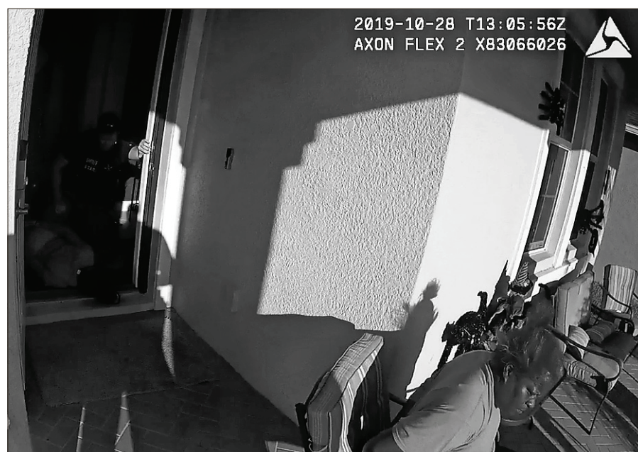
Pasco Sheriff’s Office