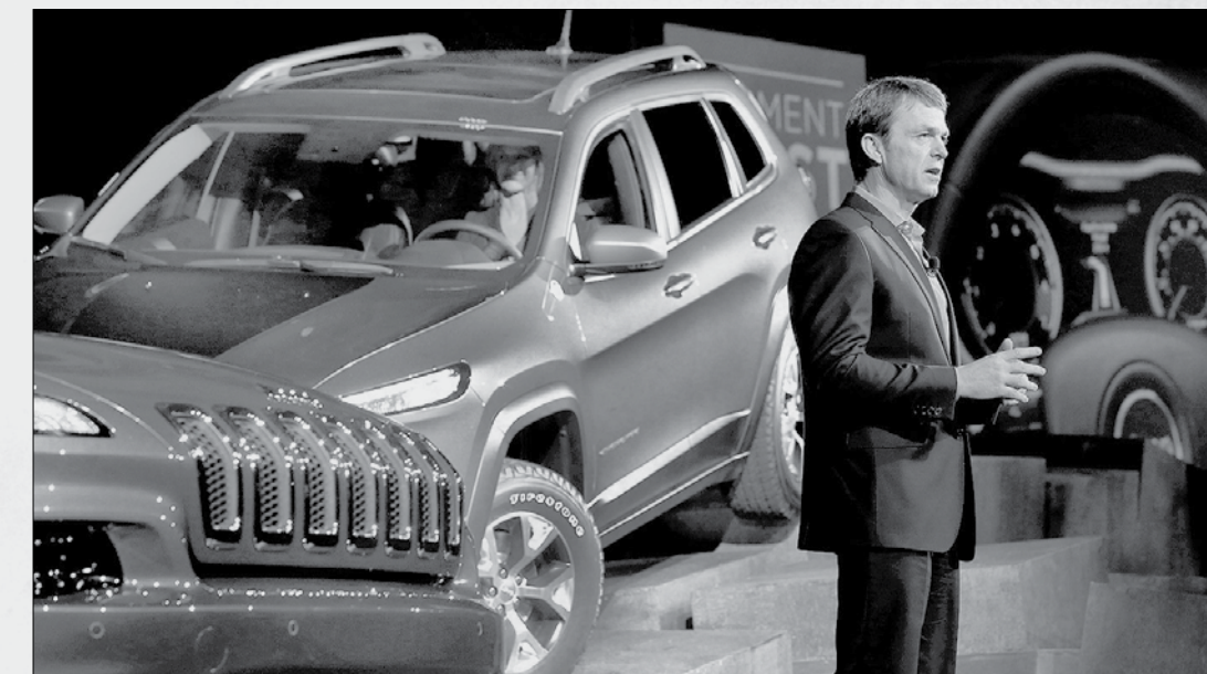
Jeep CEO Mike Manley presents 2014 models of the Jeep Cherokee at the New York International Auto Show in March 2013.