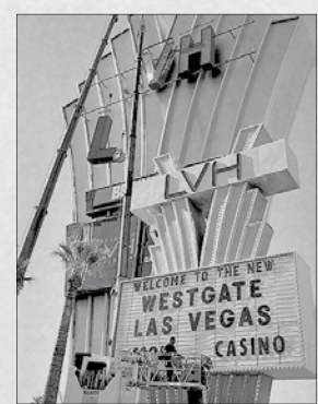
The "LVH" sign at the famed hotel is being removed by new owner Westgate Resorts.

THE STORIED FORMER LAS VEGAS HILTON , famous for staging Liberace and more than 800 sold-out Elvis Presley concerts in the 1960s and 1970s, has a new name and owner. Orlando-based timeshare company Westgate Resorts announced it purchased the LVH hotel from Goldman Sachs and Gramercy Capital and would rename it Westgate Las Vegas Resort & Casino. About 200 of the nearly 3,000 rooms and suites will be converted to timeshare villas, while others will remain open to regular hotel guests.