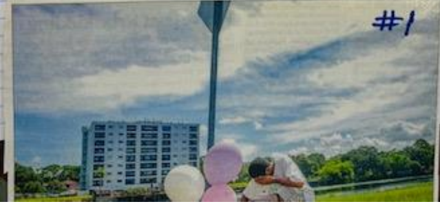
Tell The Story Sample