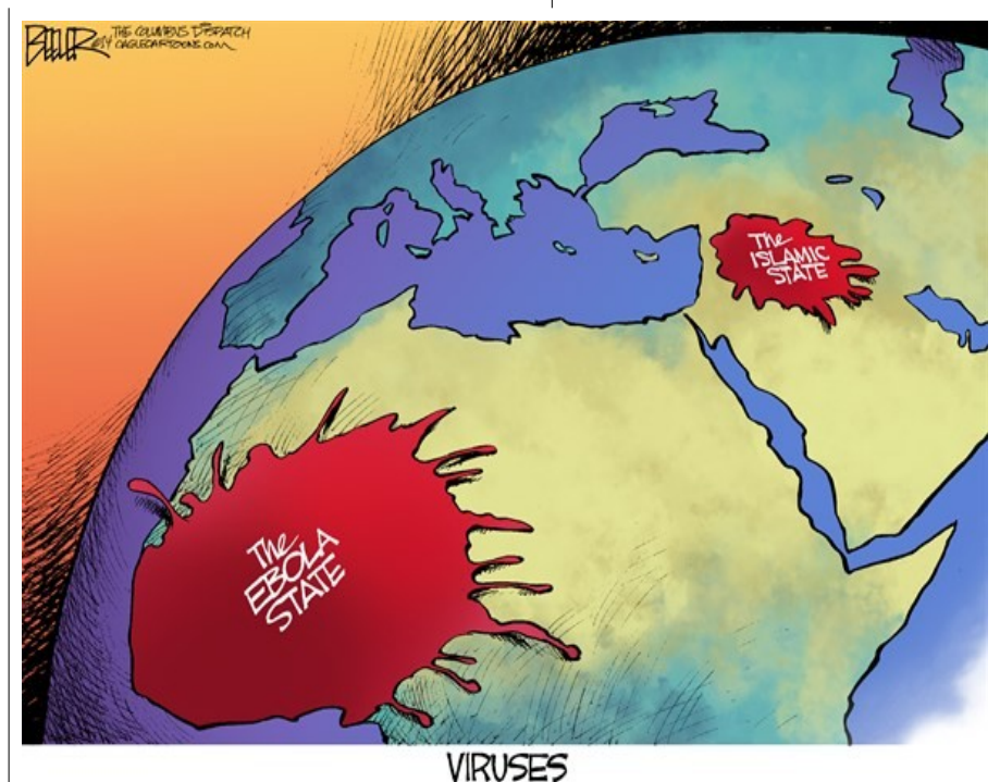
Nate Beeler, The Columbus Dispatch

Association of American Editorial Cartoonists http://editorialcartoonists.com/