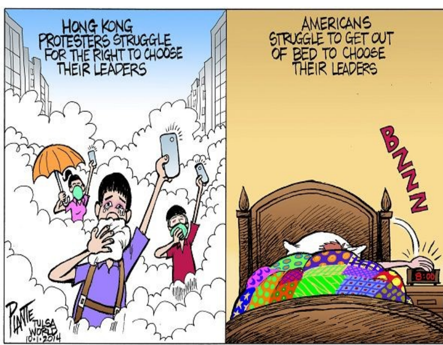
Bruce Plante, Tulsa World / Courtesy of AAEC