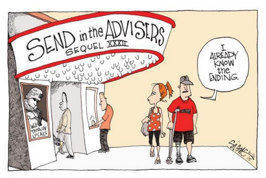
Singe Wilkinson, Philadelphia Daily News