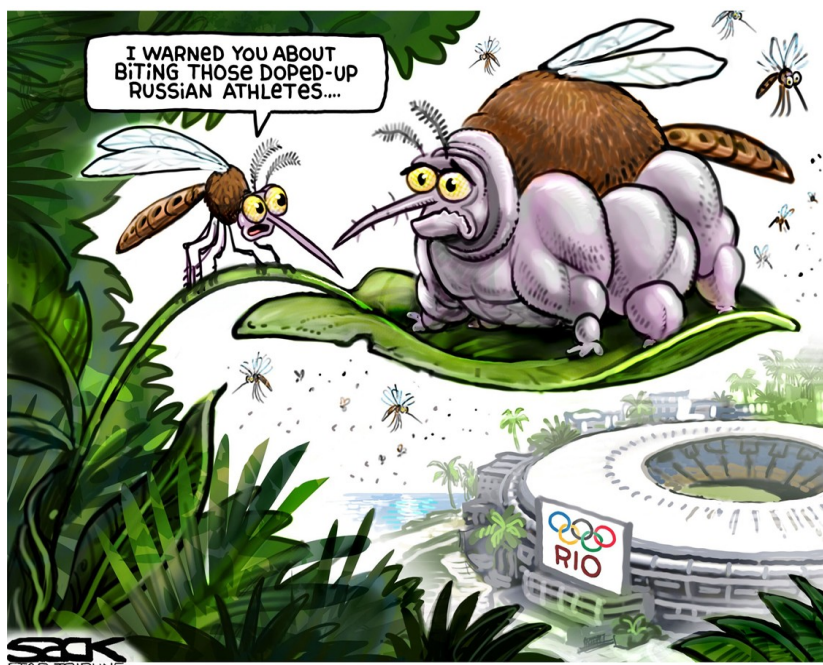
Steve Sack, Minneapolis Star Tribune / Courtesy of Cagle.com