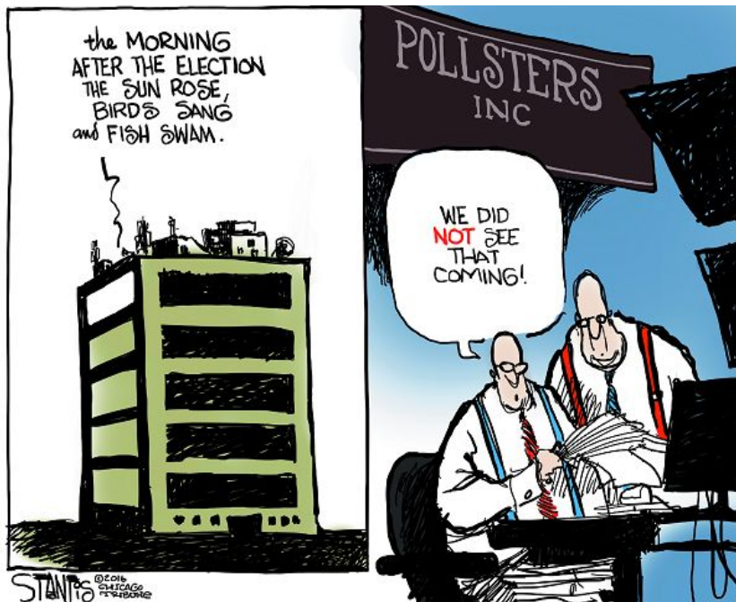
Scott Stantis, Chicago Tribune