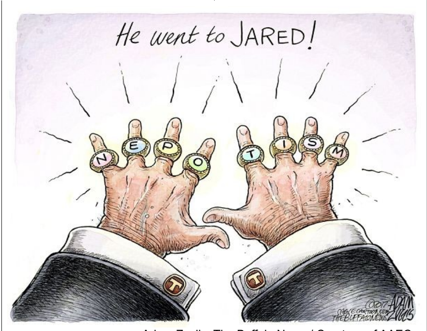
Adam Zyglis, The Buffalo News / Courtesy of AAEC