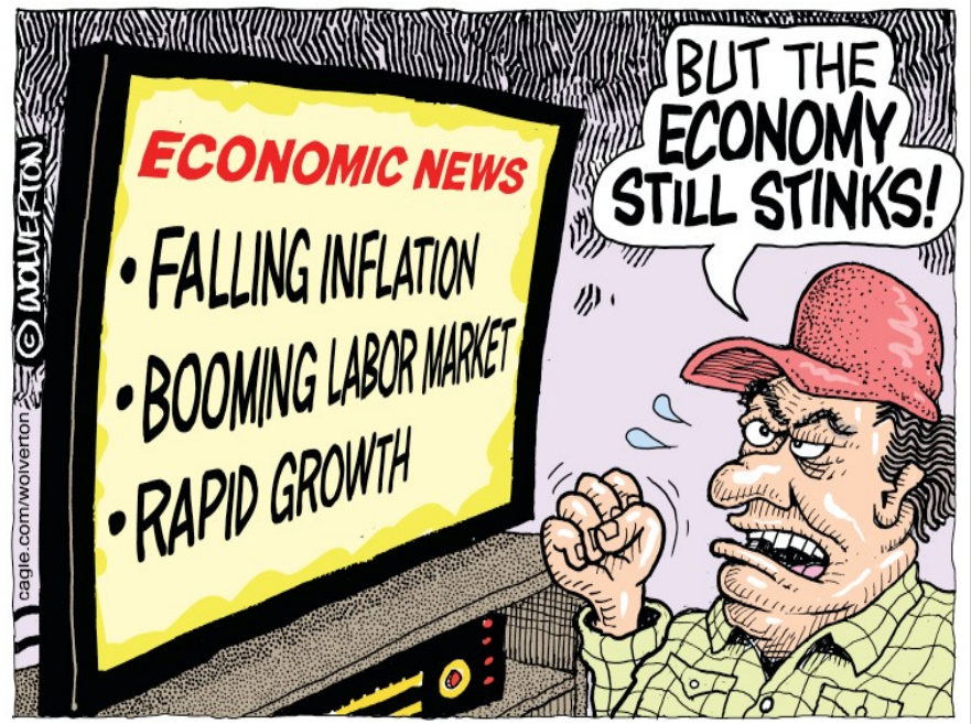
Monte Wolverton / Courtesy of Cagle.com