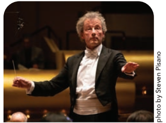
Franz Welser-Most conducts the New York Philharmonic.

A conductor sets the music's tempo (speed) for the musicians and signals people to play or change their volume by using hand and arm movements. The conductor usually uses a baton .