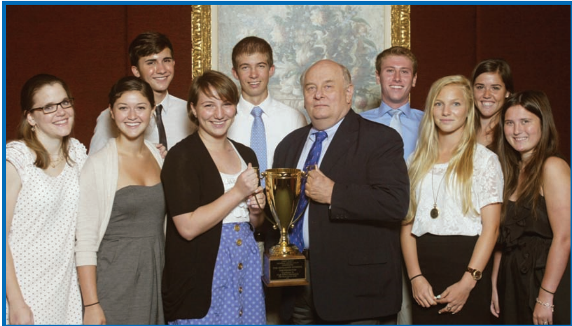
GENERAL EXCELLENCE NEWSPAPER THE PHARCYDE THE BENJAMIN SCHOOL

The best and brightest high school journalism students of Palm Beach, Martin and St. Lucie Counties gathered at a luncheon in their honor Thursday, April 28. Each year, it is The Post's pleasure to support these student writers, editors, photographers and artists. Additionally, we honor the advisers who instill the values of excellence.