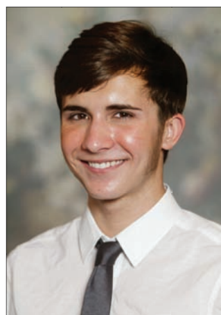
PHOTOGRAPHY MATTHEW MURRAY THE BENJAMIN SCHOOL