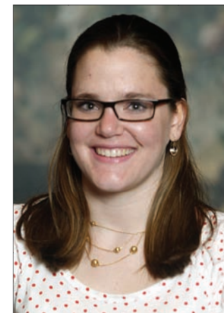
ENTERTAINMENT WRITING OLIVIA LOVING THE BENJAMIN SCHOOL

The Palm Beach Post REAL NEWS STARTS HERE