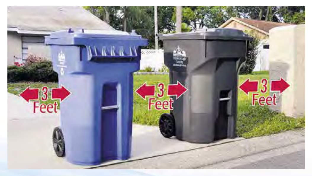
Visit HCFLGov.net/Recycling for more information.

These items are not recyclable in your blue cart. Some of these items can be recycled at other locations.