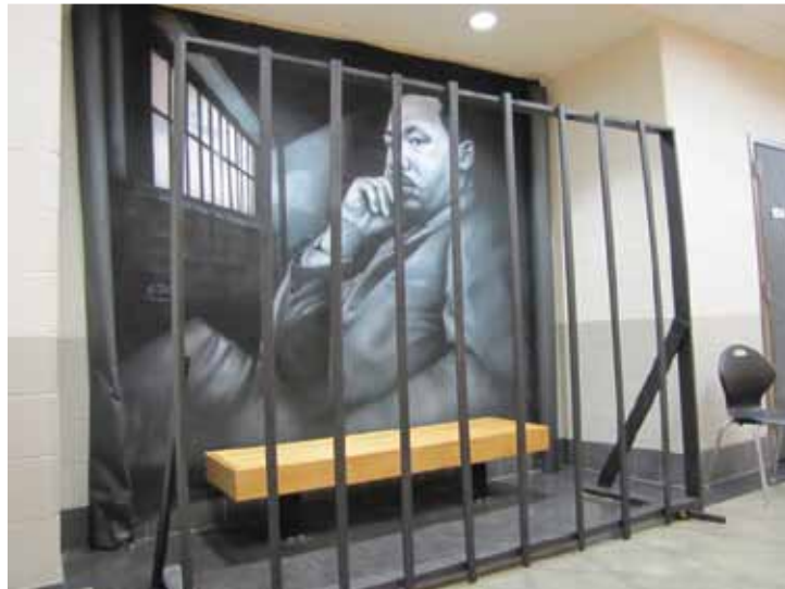
The Birmingham Jail Cell exhibit showcased Dr. Martin Luther King Jr. as he was jailed for planning a non-violent protest against racial segregation.

Other exhibits at the MLK Legacy March included: "Strange Fruit" in the Jim Crow Era, Voting Booths, Motown Music, and Detroit Auto Displays.