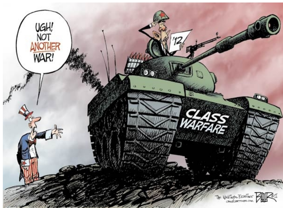
By Nate Beeler / Washington Examiner, Courtesy Caglecartoons.com