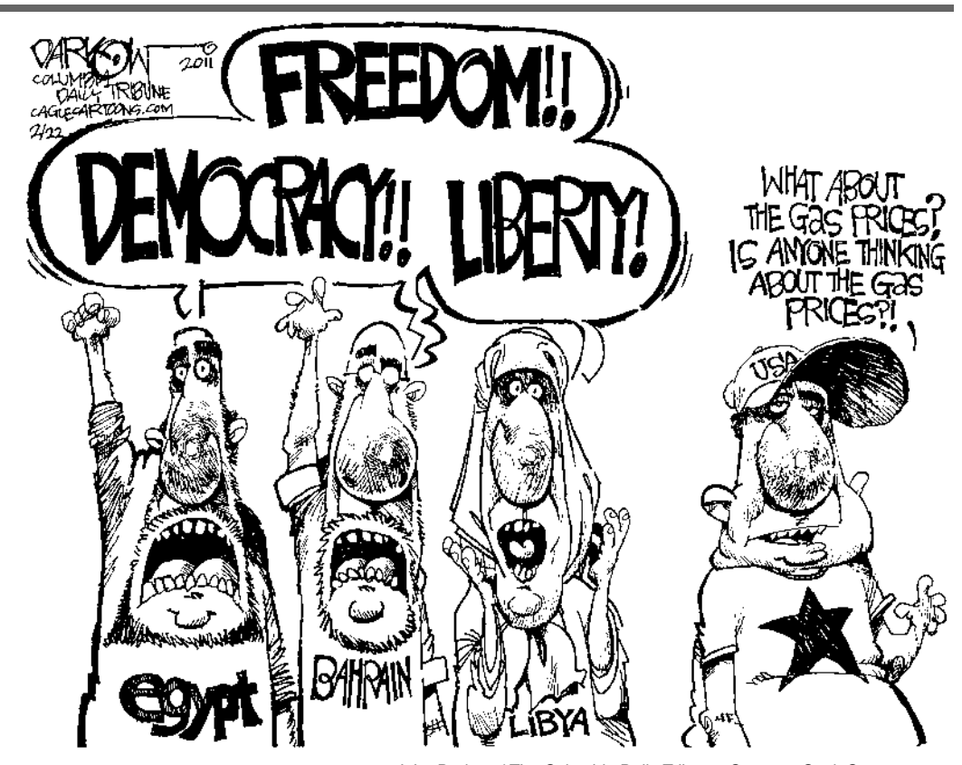
John Darkow / The Columbia Daily Tribune, Courtesy CagleCartoons.com

--ConsumerAffairs.com (http://goo.gl/3gMzl)