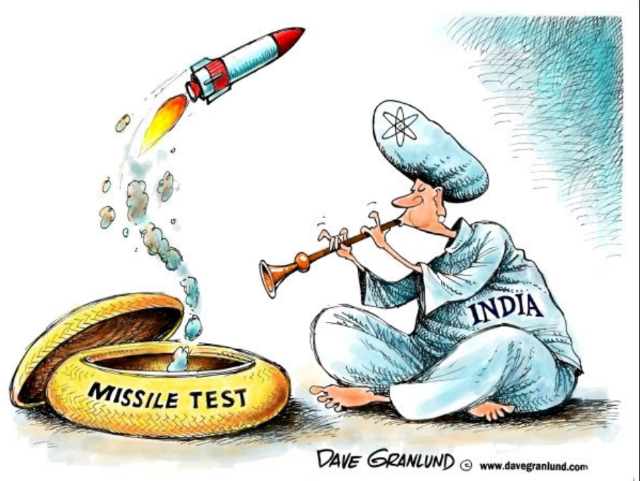
By Dave Granlund, Courtesy Caglecartoons.com