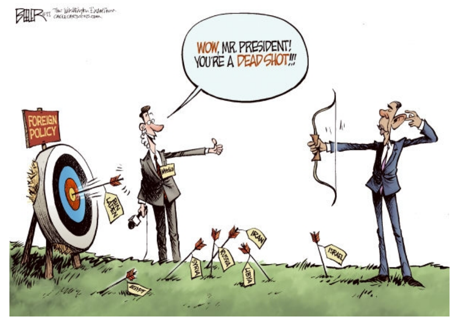
By Nate Beeler / Columbus Dispatch , Courtesy Caglecartoons.com