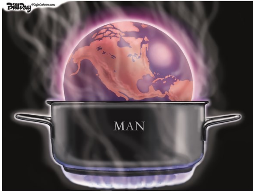
Bill Day / Courtesy of Cagle.com