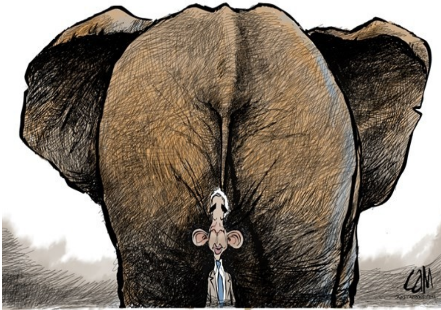
NOTE TO SELF: STOP IGNORING LARGE MAMMAL IN ROOM..."

Association of American Editorial Cartoonists http://editorialcartoonists.