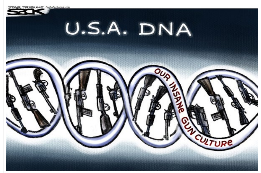
Steve Sack, Minneapolis Star Tribune / Courtesy of Cagle.com