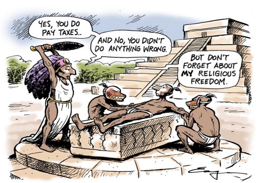
Tim Eagan, The Press Democrat / Courtesy of AAEC