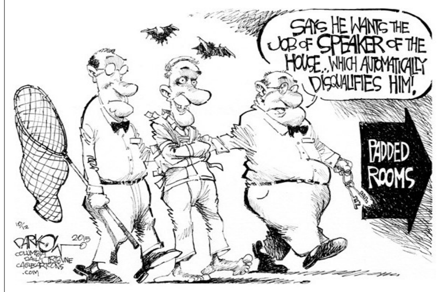
John Darkow, The Columbia Daily Tribune / Courtesy of Cagle.com