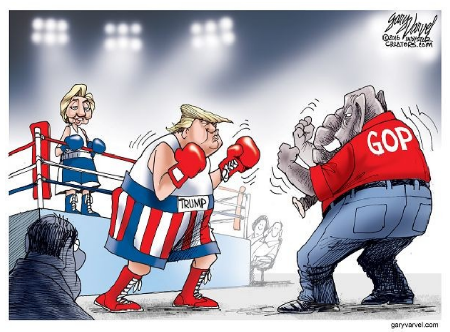
Gary Varvel, Indianapolis Star