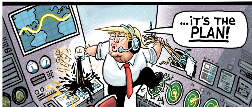
Steve Sack, Minneapolis Star Tribune / Courtesy of Cagle.com