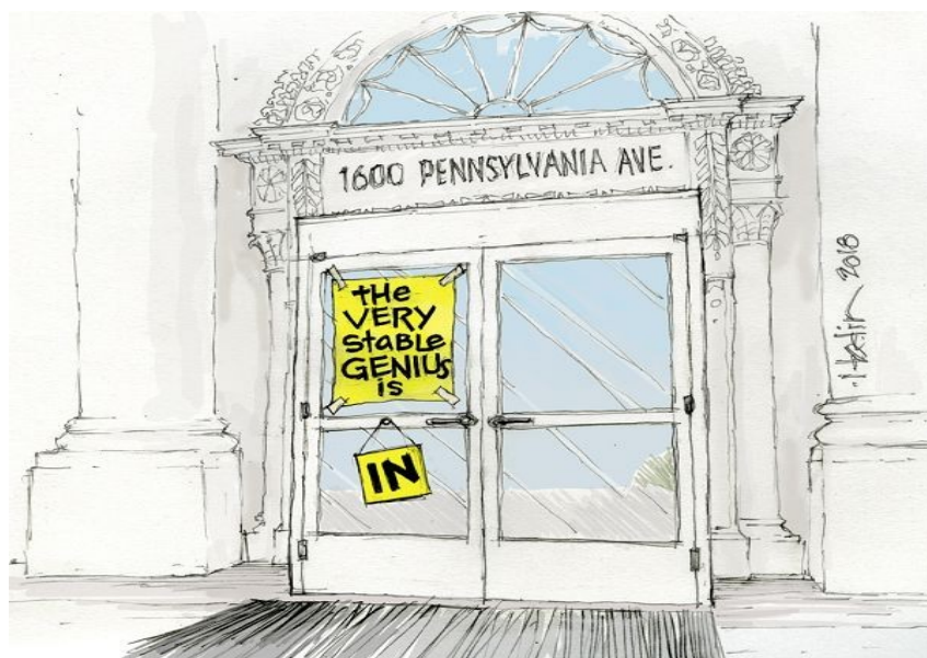
Russell Hodin, New Times San Luis Obispo