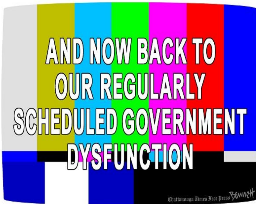
Clay Bennett, Chattanooga Times Free Press / Courtesy of AAEC