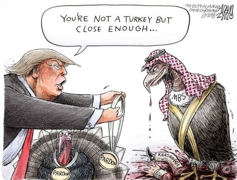
Adam Zyglis, The Buffalo News / Courtesy of AAEC