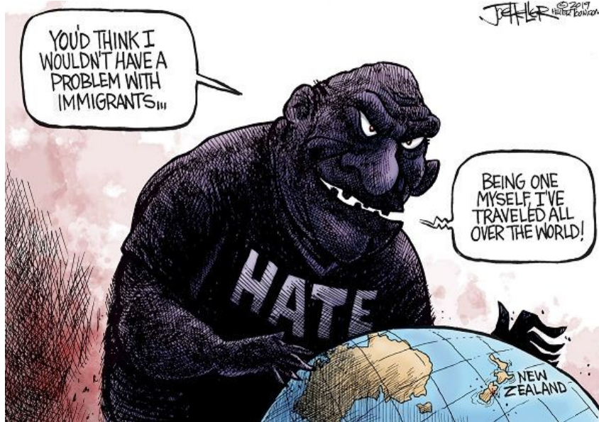
Joe Heller, Green Bay Press-Gazette / Courtesy of AAEC