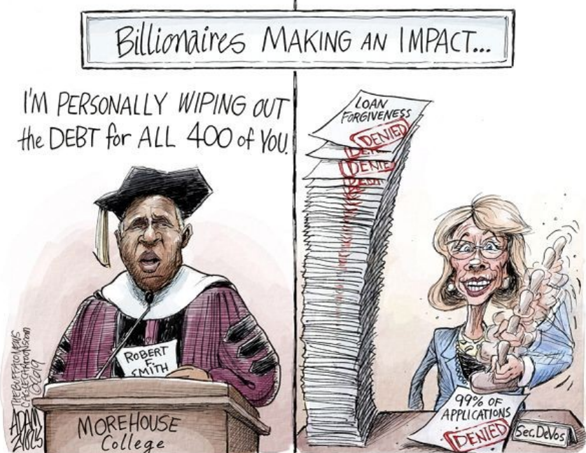
Adam Zyglics, The Buffalo News / Courtesy AAEC