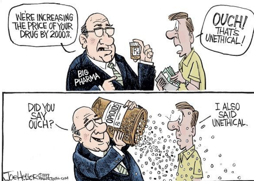
Joe Heller, Green Bay Press-Gazette