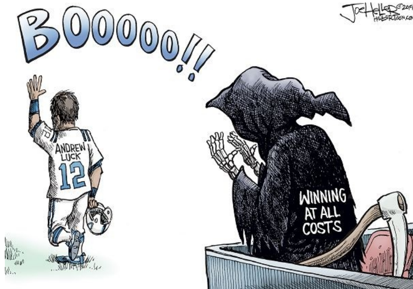
Joe Heller, Green Bay Press-Gazette / Courtesy of AAEC