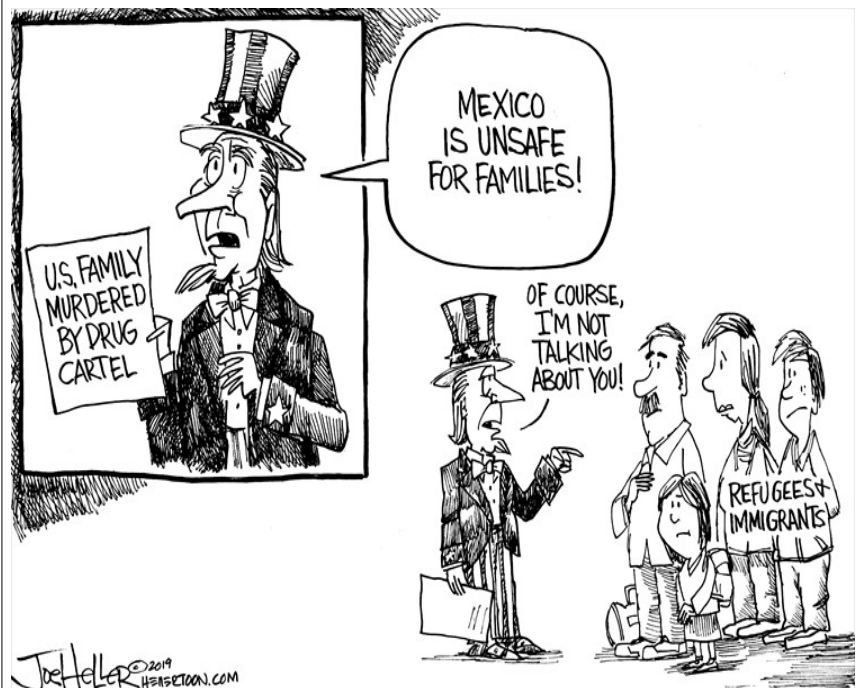
Joe Heller, Green Bay Press-Gazette / Courtesy of Cagle.com