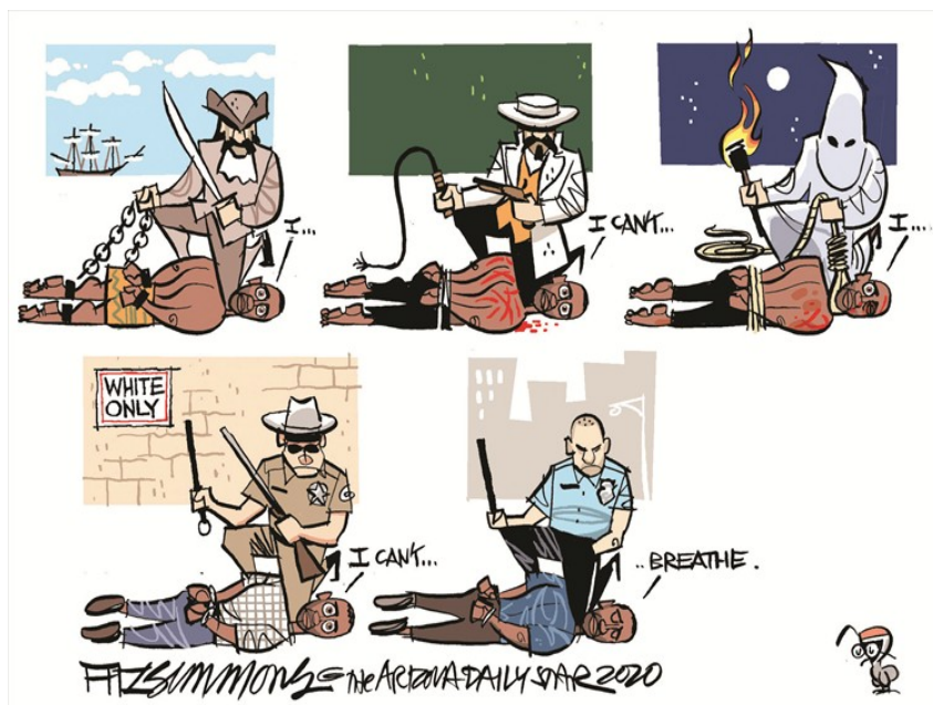
David Fitzsimmons, Arizona Star / Courtesy of Cagle.com