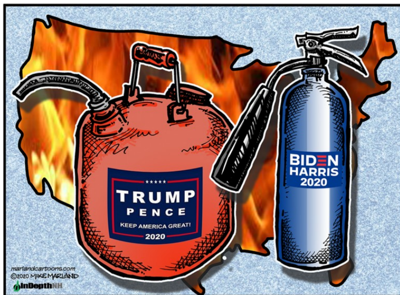
Mike Marland, InDepthNH / Courtesy of AAEC