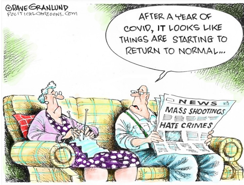
Dave Granlund / Courtesy of Cagle.com