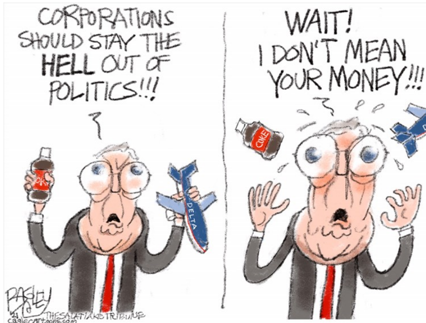
Pat Bagley, The Salt Lake Tribune