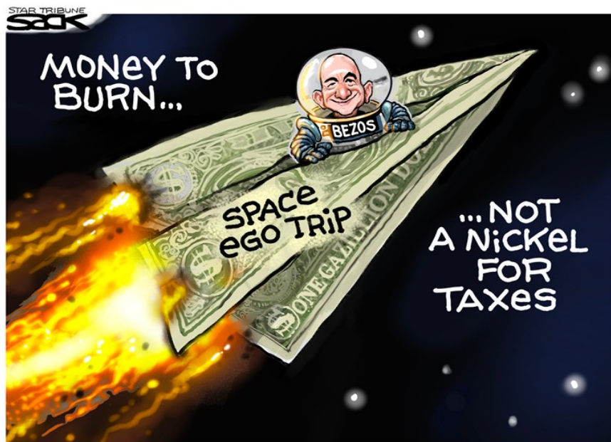
Steve Sack. Minneapolis Star Tribune / Courtesy of Cagle.com