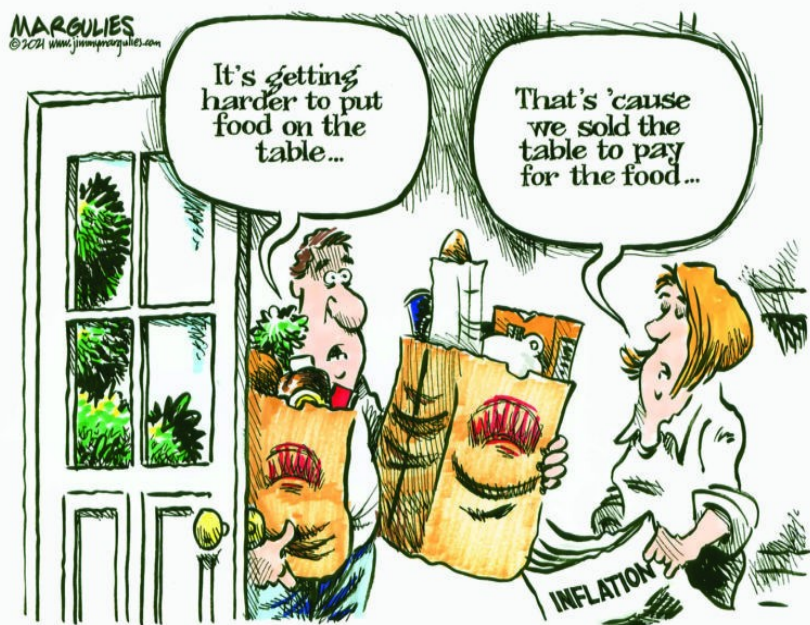
Jimmy Magulies