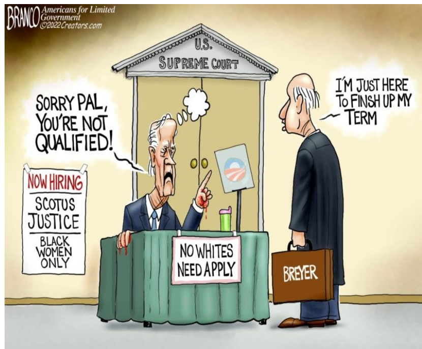
A.F. Branco Branco