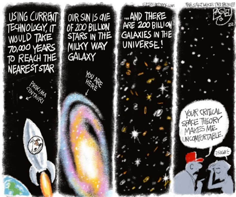
Pat Bagley, Salt Lake Tribune / Courtesy of Cagle.com