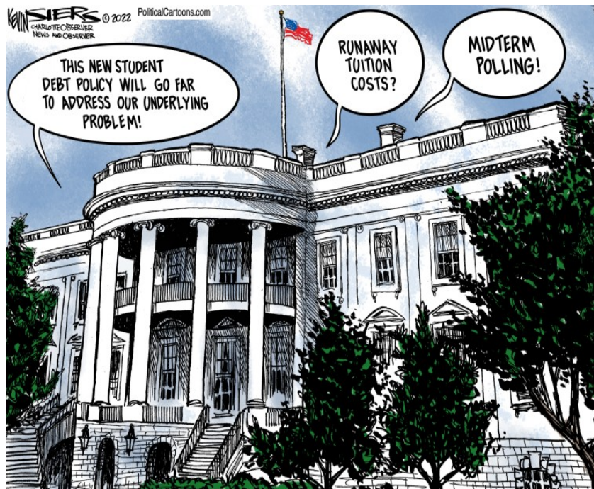
Kevin Siers, Charlotte Observer / Courtesy of Cagle.com